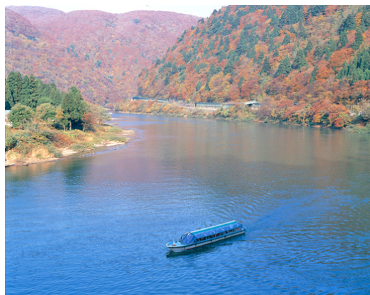
Mogami River Cruise