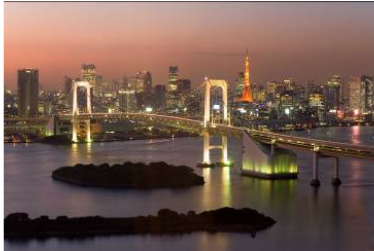
Rainbow Bridge Tokyo

Free Day : Optional tours available on request Accommodation at Shiba Park Hotel