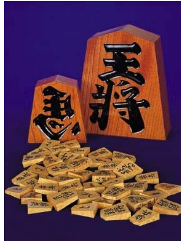
Japanese Chess Piece