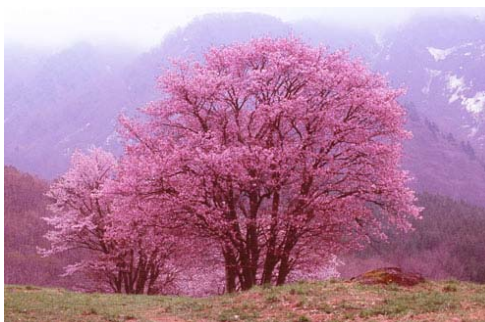
Lake Towada Cherry trees