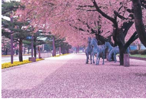
Kanchogai Dori, Towada